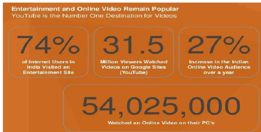
Figure 4. Entertainment and online video continues to grow