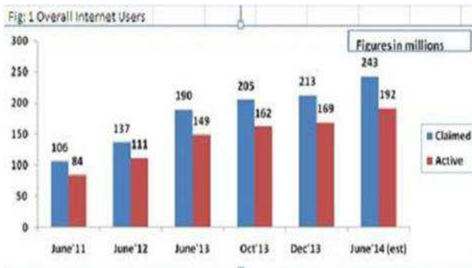
Figure 1.India is now world third largest internet population

Increase in internet penetration in the country has led to a substantial growth of other digital industries such as e-commerce, digital advertising and so on. Latest trends in digital marketing in India in web usage, mobile and search, social networking, shopping and online video are shaping the Indian digital marketplace and what it holds for the years to come.