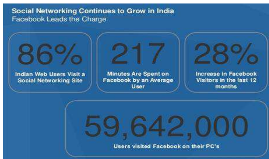
Figure 3. Majority of screen time still captured by Social media

The segment witnessed 35 per cent growth between December 2011 and December 2012 while it grew by 33 per cent between December 2012 and December 2013.