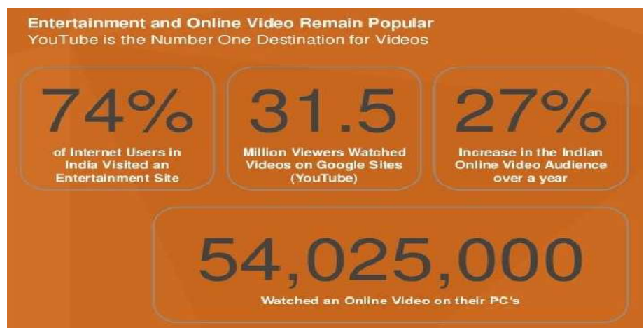
Figure 4. Entertainment and online video continues to grow