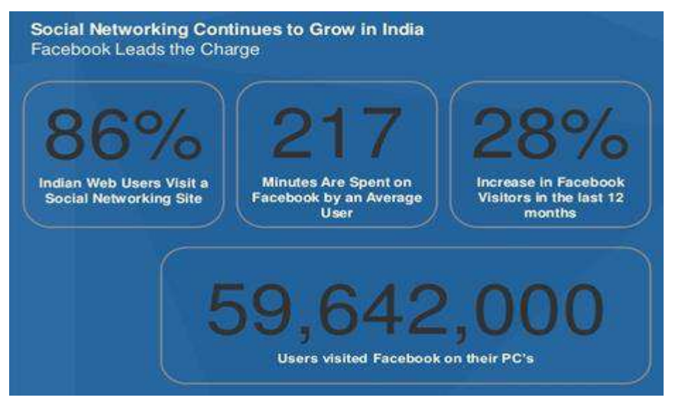
Figure 3. Majority of screen time still captured by Social media

The segment witnessed 35 per cent growth between December 2011 and December 2012 while it grew by 33 per cent between December 2012 and December 2013.