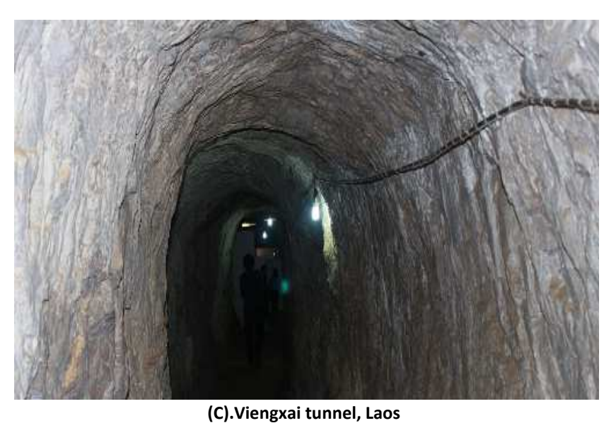
Figure 1.Some important communist tunnels in Indochina