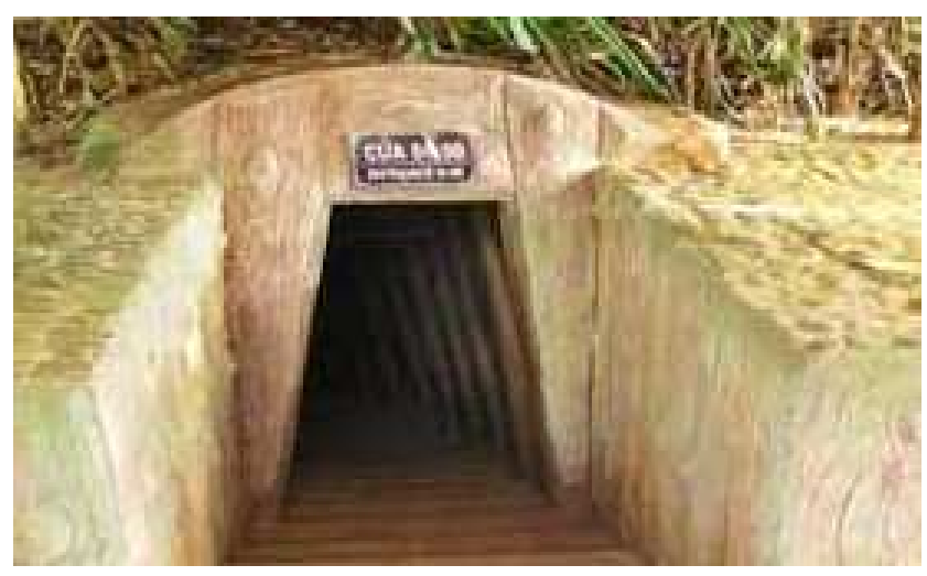
(A).Cuchi tunnel, Vietnam