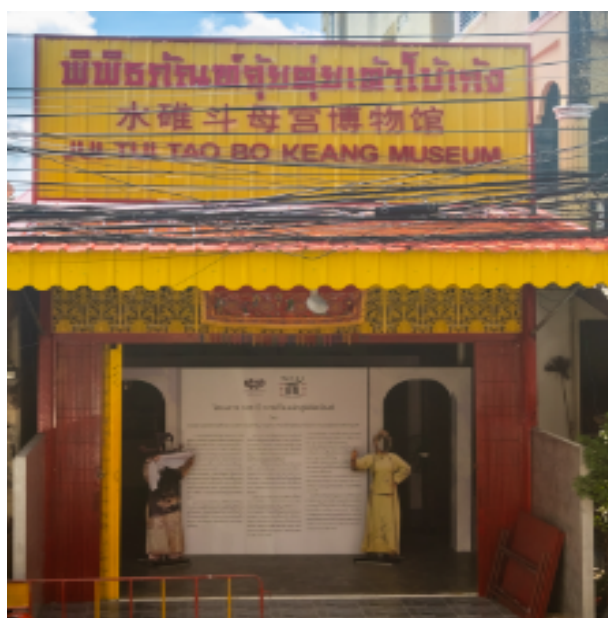
A. Juitui Taobokeng, Phuket

This is museum and cultural center locate in a province in northeastern region of Thailand. The display in this museum is modern and beautiful.