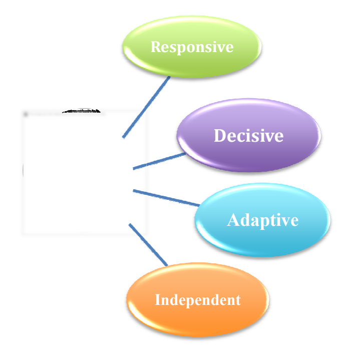
Figure 1: characteristics of Artificial Intelligence

Companies across various industries are eager to integrate AI technologies, aiming primarily for scalability. When tasks can be automated, eliminating the need for human labor, they become more cost-effective, efficient, and valuable to customers, either by lowering costs or by delivering more for the same price. Before we delve into how artificial intelligence is transforming higher education, its future role on campuses, in the job market, and beyond, it is essential to understand what AI is and its capabilities. It is proposed that artificial intelligence encompasses at least some, if not all, of the characteristics outlined on the following page, as there is no universally agreed-upon definition. (Figure 1 depicts the attributes of AI).