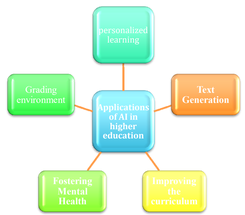
Figure 2: Applications of AI in Higher Education

Through the automation of processes, personalization of learning environments, and data analysis to enhance overall efficiency, artificial intelligence (AI) significantly contributes to increased administrative efficiency in higher education. Educational establishments may save money and time because of these developments. By providing individualized learning experiences and modifying curricula to increase student engagement, artificial intelligence (AI) has the potential to completely transform the educational landscape. Because of this, AI will be a potent instrument in determining the direction of education in the future. Figure 2 depicts the application of AI key areas in higher education.